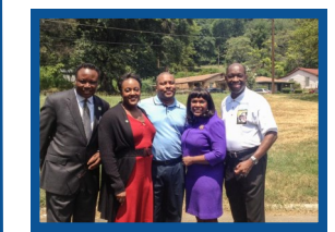
We met with EPA officials on August 4th to tour and check up on clean-up efforts in North Alabama.