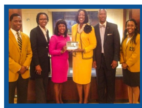
Congresswoman Sewell presented Alabama State University's first female president, Gwendolyn Boyd, with a gift following her inauguration on September 5.