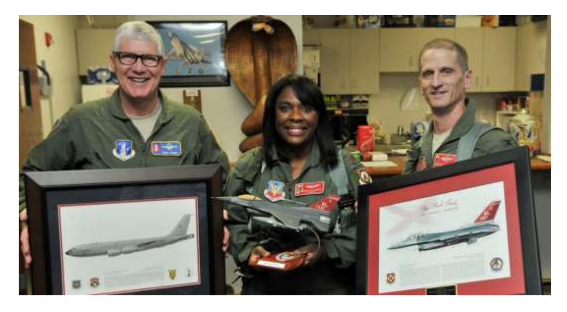
187th Air National Guard Fighter Wing Unit wins bid for F-35 combat fighter jets

WASHINGTON, D.C. – On Thursday, the Secretary of the Air Force announced that the 187th Air National Guard Fighter Wing Unit at Dannelly Field in Montgomery, Alabama, was selected as one of two new sites to receive the new F-35A Lightning II fighter jets. The F-35 decision builds on the long and proud history of the 187th Guard Unit which is also home to the historic Tuskegee Airmen Red Tail Fighters. As a result of the decision, the City of Montgomery and the River Region will receive approximately $3 billion in new capital investment and $70 million in new construction. The delivery of the F-35 fighter jets is slated for 2023.