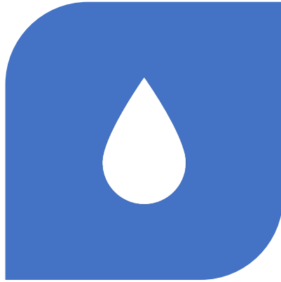
GENERAL SUPPLEMENTAL CW AND DW