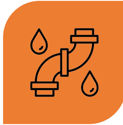
LEAD SERVICE LINE SUPPLEMENTAL DW ONLY