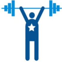
BUILDING A STRONGER GSA