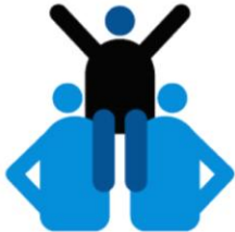
SERVING OUR PARTNERS