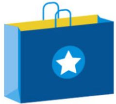
EXPANDING OPPORTUNITIES FOR SMALL BUSINESSES