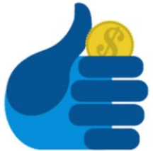
DELIVERING BETTER VALUE & SAVINGS